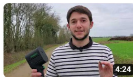
TUTO Utilisation du scanner - réalisé par Vertal