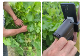
choix du rameau de vigne