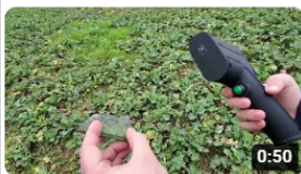
Mesure sur feuille de colza

Go to YouTube to view the tutorials! @senseen9611